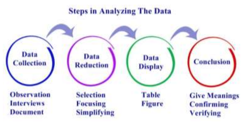
Figure 2. The Steps in Analyzing the Data

This research used descriptive quantitative and qualitative. It was done at Universitas Harapan Medan and majoring of Informatics. The population was 65 computer students in first semester. Data collection techniques used triangulation: questionnaires, interviews and observations. The research was done for 3 months with online learning by using google classroom. The students were given post-test and pre-test. The reasearch observed and gave questionaires to students to evaluate students' independent in learning, and also interviewed 10 students randomly. In analyzing the data, the data was elaborated and described by using some steps, they are collecting the data (observation, interviews and dicument), data reduction (selecting data, focusing and make simplifying), data display (presented in table and figure) and conclusion (give meaning, confirming and verifying). The steps can be seen in the figure below.