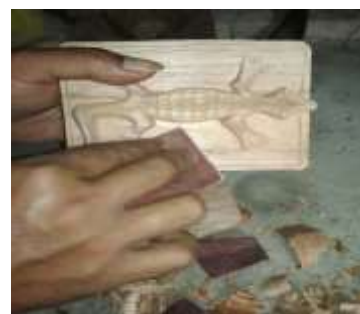
Figure 8. Make the Cover