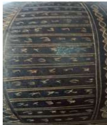
Figure 18. Taboo as a media