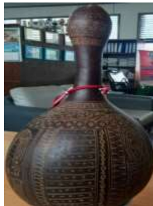
Figure 17. Pumpkin ( tabu-tabu )