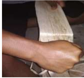
Figure 2. Flatten the bark