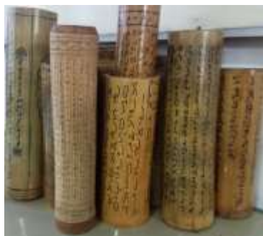
Figure 12. Bamboo that has been written by the Batak script