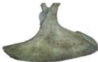
Figure 4. Shoulder Blades

According with the observations in the field it was discovered that the bones used as media for writing Batak letters or writing the dates and directions of the cardinal directions were buffalo bones. The parts that often to use are ribs and shoulder blades ( sasap ). Ribs are used to write the date of Batak, while shoulder blades are used for the corners of the compass.