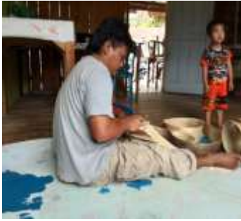
Figure 1. Removing the outer