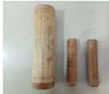
Figure 13. Bamboo that has been written with dates of Batak

Bamboo is an easy media to get, but it is rarely used to write the long texts because bamboo's capacity to store the text is very limited. That is why bamboo is only used for short texts, such as calendar, incantations, proverbs, and parables. Bamboo endurance is relatively the same as the other media.