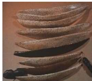
Figure 5. Ribs