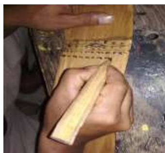
Figure 7. Writing the Media