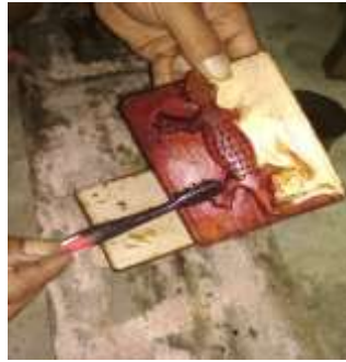
Figure 10. Coloring the Cover