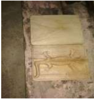
Figure 9. Dried the Cover