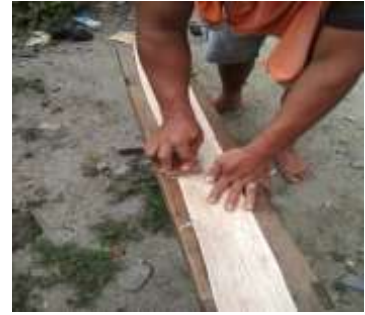
Figure 3. Sand the bark

Remember that it is difficult to obtain agarwood of bark, the copying of old Batak manuscripts is very rare. For this reason, sometimes even poor quality bark is used to write pustaha laklak . So, in addition to the contents that are short and a little relative, then the library is not long-lasting. If you want to produce quality pustaha laklak , then the media used should be really good (dry, not squiggly, not torn).