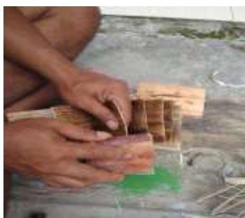
Figure 6. Folding the Media