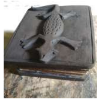
Figure 11. Text has Done

In the past, the ink which used to write the characters on bark media was bamboo sap or orange stem sap ( unte ). Bamboo stems that are still green are burned and will release liquid. Thus also, the orange stems. The sap or liquid that comes out is collected in a container, which will be mixed with charcoal ( agong ). Candlenut is the best source of charcoal to be used as a gum mixture. Candlenut is burned to a scorch, then broken down and stirred with the liquid of gum from bamboo and orange sticks. In addition to a deeper black color, the durability of this ink is relatively longer. While the stationery used is a stick or pen that is often used by using the Chinese ink.