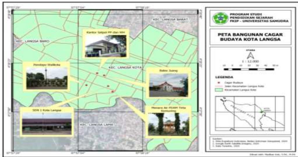
Figure 2. Map of the Cultural Heritage Building Area based on the Langsa Mayor's Decree