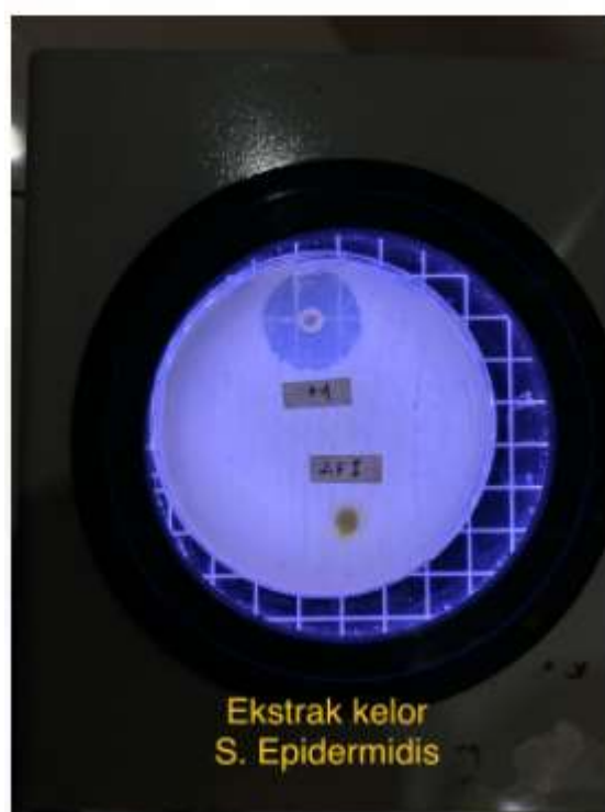
Figures 2. The extract change pattern