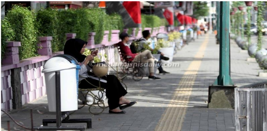
Figure 6. The renovated Merdeka field park

Research is a way of finding an opinion by carrying out several stages or an investigative process to reach a conclusion that will later lead to various interpretations from the visiting community. And this interpretation will lead to a social action carried out by the community. For this reason, the purpose of this research is to find the best way to represent the community without provoking a view of the interpretation of parks and detriment so that people can act more wisely and responsibly in using public facilities.