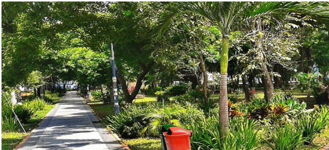
Figure 4. Green Open Spaces in the City

To enter the location of the park, it is best to give the floor shape so that between the garden and the entrance it is not too high. According to the Guidelines for Building Construction Materials and Civil Engineering in the Technical Planning of Pedestrian Facilities by the Ministry of Public Works and Public Housing No: 02/SE/M/2018 V Date: February 26, 2018 The function of placing the ramp at the park entrance for pedestrians is: