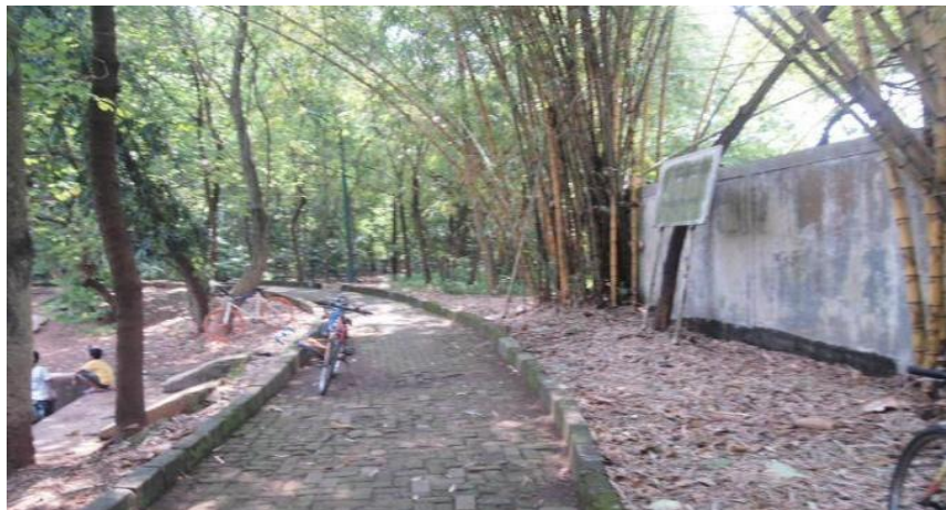
Figure 1. Abandoned City Park

This situation becomes a negative value that invites higher crime rates, becomes an area for muggings and pickpockets, and other acts of violence. What's worse, parks like this are used as places for young people to commit immoral acts.