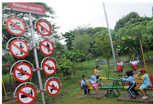
Figure 3. Installation of Symbols in City Parks

So that Interpretation is a perspective in interpreting, interpreting, or formulating problems with an object produced. Interpretation can be carried out or carried out by anyone depending on the way of looking at and the background of how to interpret the object of a problem that is conveyed either with symbols or in the form of images that can be understood. (Source: person's name, Year). For example, in this case, it is given a symbol or a sign is prohibited, entering, prohibited from selling, prohibited from being passed, and prohibited from parking in a place or land or other supporting equipment.