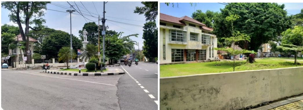
Figure 8. Lily Suhaeri Garden Sculpture and Yard

Pedestrians around this park are also very unfit for pedestrians, apart from being unsafe from material problems, they are also damaged by being pushed by the roots of old trees. The pedestrian path is also used as illegal parking which is used by some people. For this reason, it is hoped that there will be follow-up from the authorities to immediately renovate so that the existing damage does not get worse. And it can restore the function of this park to its proper place, so that later people can use it as a place for recreation, play or just sit back and enjoy the beauty of the park.