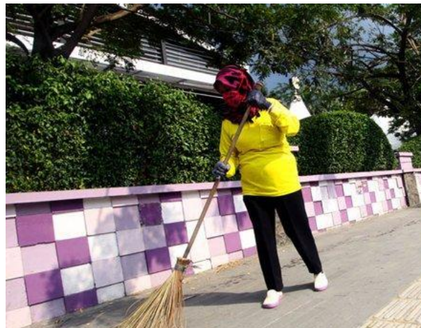
Figure 7. Visitors and Cleaning Officers

Garbage is scattered and spoils the view of a park, making it look dirty. Even though there have been special trash bins in the park, there are still scattered and careless disposal, this is a problem that needs to be addressed together. The trash can should be divided into several trash bins from plant waste in the form of leaves and tree branches where this samaph is made permanent, different from trash bins for visitors. This requires concern from all parties, both park visitors and cleaning staff.