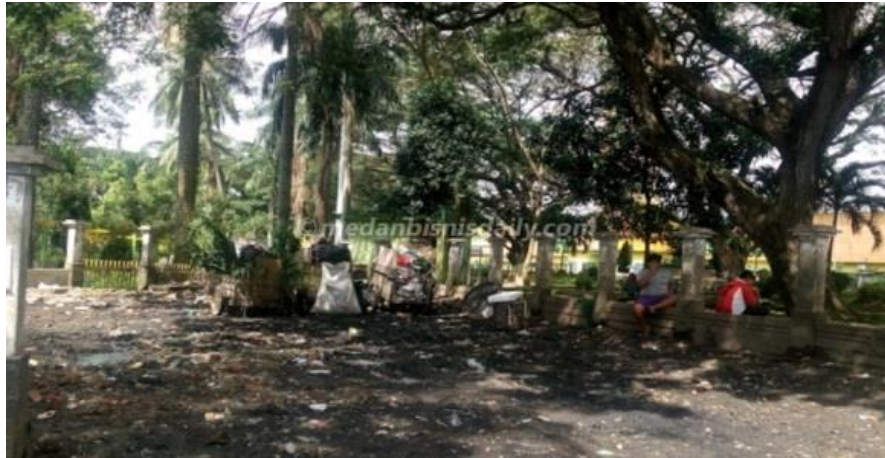
Figure 2. Inappropriate City Parks Full of Garbage and Irregular