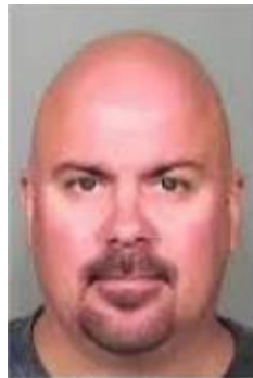
Figure 2. FBI fugitive: Russ Medlin

Cybercrime cases that have occurred have even caused a stir because FBI fugitives were able to enter Indonesia, namely the cyber crime case committed by Russ Albert Medlin in 2020.