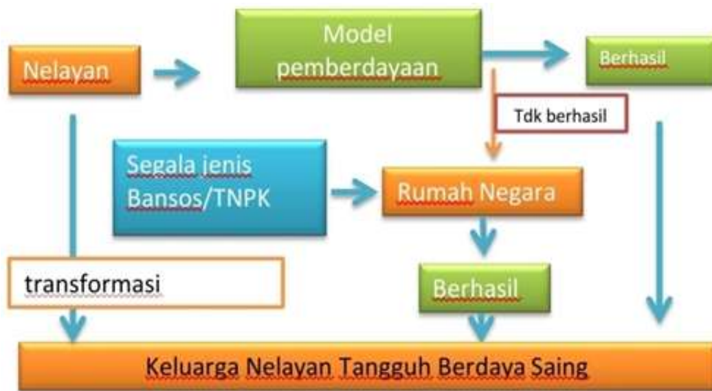
Figure 2. Overall Empowerment of Fishermen Communities

While the fishing profession is wide open. Marine and fishery resources still accommodate thousands of workers. It depends on the work method used. There is no term no work. This situation is a solution to the employment problem called the 2025 demographic bonus, the impact of the population explosion. The world of work exists in the maritime world, marine resources and fisheries, which are managed in a systemic-ecological-holistic manner based on a strong vertical backing, strong faith and piety competing to do good. In individuals, Allah SWT has fulfilled the blessings of this world and the hereafter. Through the intention of worship because of Allah SWT, excess sustenance can be charitable, enough sustenance can be grateful, the rest is sincere because of Allah SWT, all of which will be a record of good deeds that will benefit in the hereafter. Finally, the happiness of the world and the hereafter is obtained. There is no longer a rich and poor dichotomy, everything moves for virtue and happiness, the capital exists and is complete.