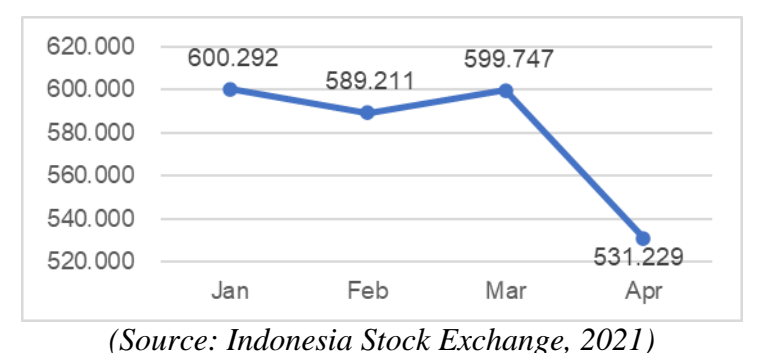
Figure 2. Number of Interactive Access Users

Figure 1 shows that the number of Indonesian capital market investors in 2021 every month tends to increase, making the need for Capital Market data also increasing. The increasing number of needs for Capital Market data is a great opportunity for IDX because it will expand the market and increase the number of interactive access users. However, in Figure 2, it can be seen that in 2021 every month the number of interactive access users is experiencing a fluctuating growth. Though the moment of increasing the number of investors in each month can be an opportunity to increase the number of interactive access users every month. The number of users of this interactive access shows the number of users of IDX capital market data products.