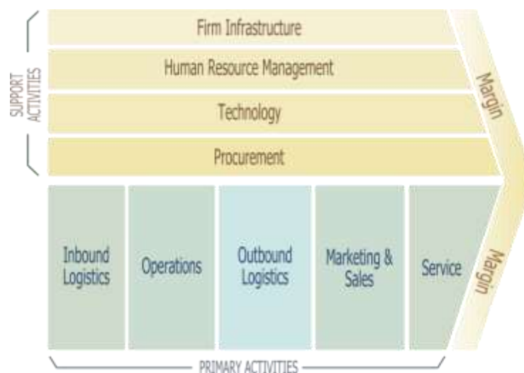
Figure 1. Value Chain Value

Chain isa series of activities carried out by a company to produce products or services . This concept was popularized by Michael Porter in the book Competitive Advantage: Creating and Sustaining Superior Performance (1985). According to this concept, company activities are divided into two major parts, namely primary activities support activities as shown in Figure 1.