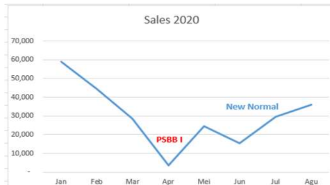
Figure 1. Sales for All Brand for 2020 (in million)

The following in table 1 is the sales data of PT Mega Perintis Tbk in 2020 for the period before the pandemic, the PSBB period and starting to enter the new normal. There has been a decrease in sales of up to 92% in April 2020 since the enactment of the PSBB policy compared to normal month sales.