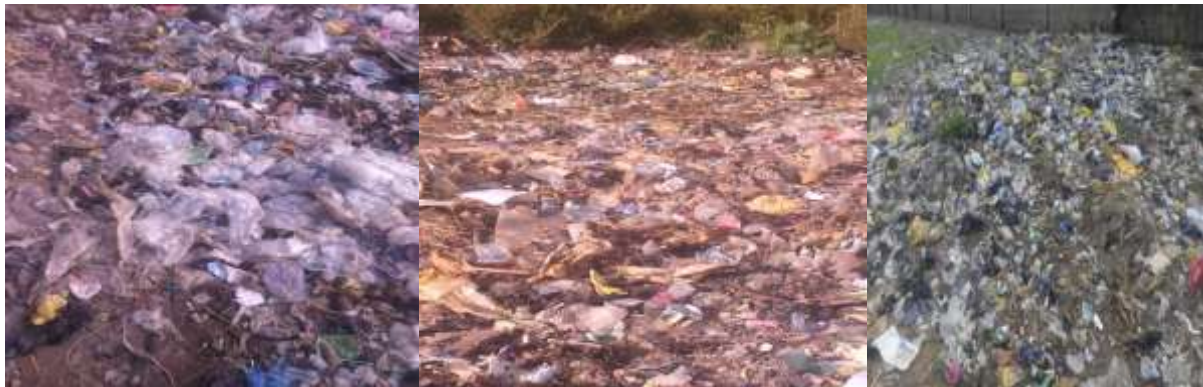
Figure 2. Pictures of some communities and markets in Gusau city Zamfara state

on the respondents, the results showed that, at home, polyethylene for assorted items was the highest (61%), closely followed by biscuit wrappers (20%), table water sachets (14%) and ice cream wrappers (5%) respectively. for assorted items ranked lowest in the market because they are used in wrapping items in the market but disposed of at home having removed the contained items for cooking or storage. The generation of table water sachets was lowest at home but highest in the market. This is so because most homes have refrigerator where they can store water for it to get cool/cold. This finding is in agreement with Aziegbe's (2007) study in Benin, Edo State, Nigeria.