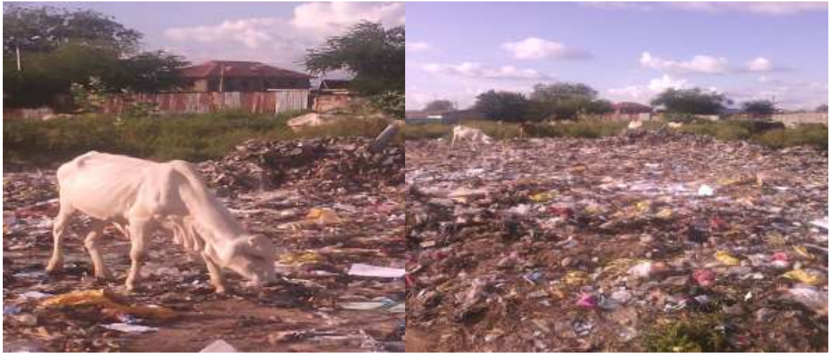
Figure I. Picture of some place with rampant disposal of polyethylene bags in Gusau city of Zamfara state Nigeria