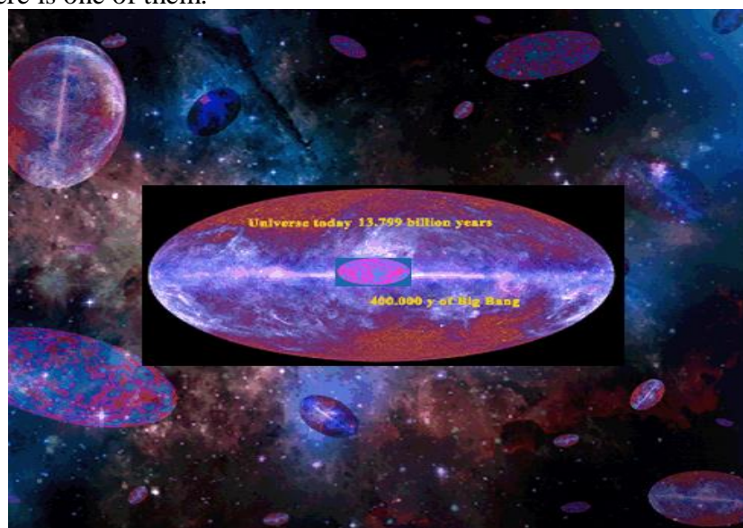
Figure 2. The Expanding Universe – history (my compilation)

The existence of redshift above the value ( z ) 5 pointed out that if ( z ) continues to grow, the concept of mainstream – 13,8 Gly (Big Bang) – is going to fall apart. Nowadays, the instruments register the value ( z ) of 11,9. When there is an overwhelming resistance from reactionary institutions and scientists, despite the newest measurements, then there appear unbelievable new ideas that do not belong to physics nor they represent science. The theme that is discussed here is one of them.