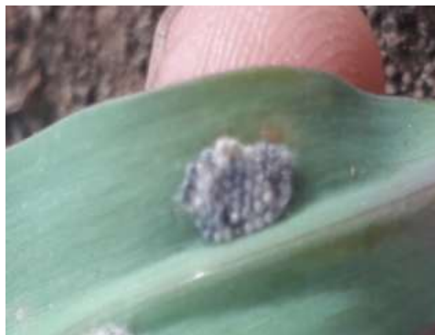
Figure 11. View of a group of S. frugiperda eggs parasitized by egg parasitoids Trichogramma sp. in the Field

The research results on the parasitoid Trichogramma sp.'s percentage of parasitization at 5 release points showed that all groups of eggs experienced parasitization ranging from 68.5 – 87.3 per cent with an average of 76.5 per cent. The results of this research can be said to be successful because using natural agents to control the insect pest S. frugiperda with the