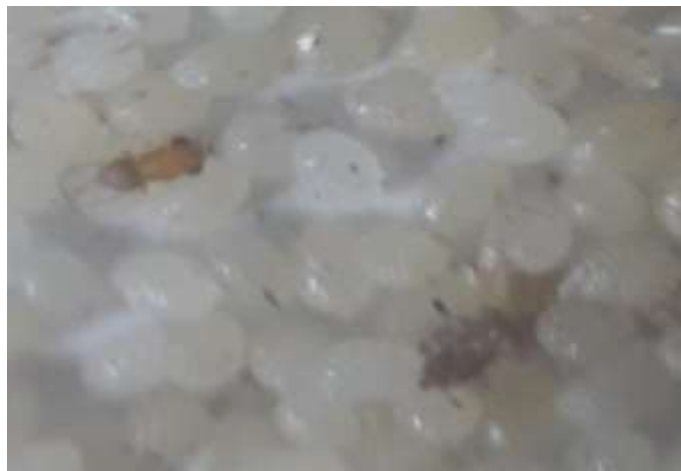
Figure 1. Parasitoid Trichogramma sp. The female is temporarily laying eggs on C. cephalonica host eggs

When C. cephalonica eggs are infected by the parasitoid Trichogramma sp., the shape and size of the parasitoid eggs are difficult to observe, so observations are only made by looking at changes in the colour of the C. cephalonica host eggs. Observation of the egg stages of Trichogramma sp. only about 14-15 hours since it was laid (Figure 4). During the development of parasitoid eggs on host eggs, it was seen that there was a change in the colour of C. cephalonica eggs, which turned slightly creamy white (Figure 5).