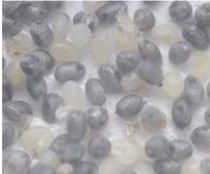
Figure 6. C. cephalonica eggs parasitized by Trichogramma sp. On the fifth day