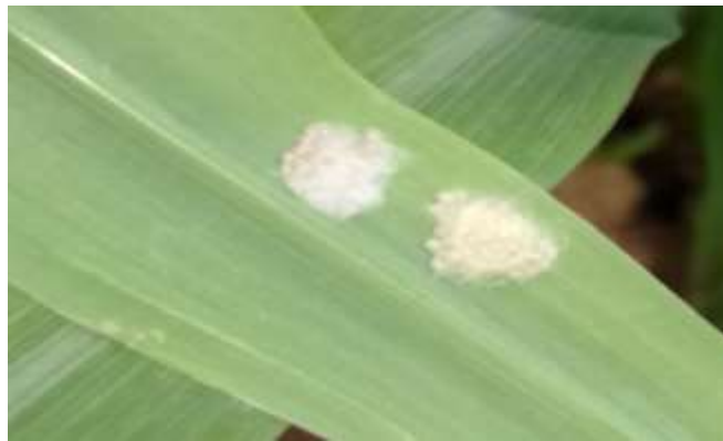
Figure 10. A group of S. frugiperda eggs that have just been laid on a leaf are visible Corn (3 weeks after planting) with parts that have not been parasitized

From Table 1, above, it can be seen that parasitization of the parasitoid Trichogramma sp. can parasitize the host group of S. frugiperda eggs in the Field. The S. frugiperda pest attacks young corn plants around 3 weeks after planting. Egg group Trichogramma sp. can be found under the surface of corn plant leaves and, after a few days, will hatch into larvae and damage the leaves of corn plants (Figure 13). The effectiveness of parasitization is achieved by releasing parasitoids in the Field by attaching eggs to vials. Then, the group of host eggs is infected with adult parasitoids that have mated and are ready to lay eggs in a parasitization process. Groups of host eggs that have been parasitized in the Laboratory after 6 days of age will be released in the corn planting area 3 weeks after planting. Groups of S. frugiperda eggs in the Field parasitized by Trichogramma sp. will turn black; this indicates that the pest egg group has been parasitized (Figure 14).