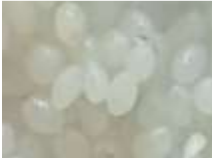
Figure 2. View of C. cephalonica eggs that have just been parasitized by Trichogramma sp. on the first day