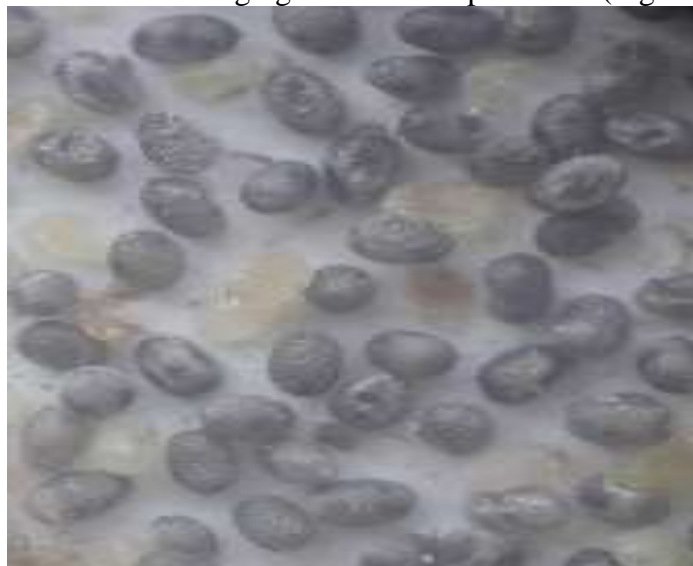
Figure 7. C. cephalonica eggs parasitized by Trichogramma sp. On the sixth day, it enters the pupal stage.

Biological development or life cycle of the parasitoid Trichogramma sp. In the host egg, C. cephalonica will follow the development of complete metamorphosis, namely development from the egg and larval stages, and enter the pupal stage before becoming an adult insect. The host eggshell's colour changes due to the development of the last instar larval life stage and entering the stage. The observations showed that all the host eggs had changed colour to black, and there were points of life inside the host eggs. The development time required is 28 hours before emerging into an adult parasitoid (Figure 10).