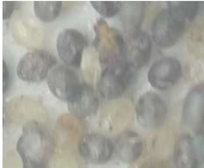
Figure 8. Parasitoid Trichogramma sp. emerging adults from C. cephalonica host eggs

female parasitoids can live for 10-12 days while males live for 10-11 days (Figure 12). The female parasitoid will mate 1 day after emerging from the host's egg, and the female can lay eggs after the next 1-2 days. The female parasitoid can lay eggs on the host's eggs solitary and as many as 20 times. After 5 days of parasitization, the female parasitoid will die. Based on observations, unmated female parasitoids can lay eggs on hosts as a form of their ability to continue generations by parthenogenesis.