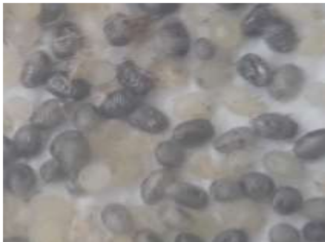
Figure 5. C. cephalonica eggs parasitized by Trichogramma sp. On the fourth day

Observations on developing the third instar larval stage of the parasitoid Trichogramma a sp. In the C. cephalonica host eggs, it can be seen that fundamental colour changes are starting to occur where it appears that the colour of the host eggs has turned greyish black (Figure 8). The time required for this colour change to occur is around 25 hours in the third instar larval stage.