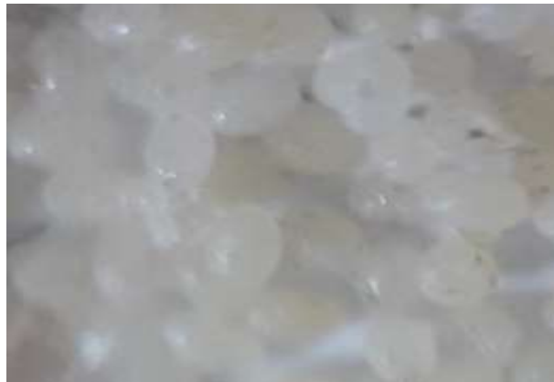
Figure 3. C. cephalonica eggs parasitized by Trichogramma sp. On the second day

Morphological observations on the development of the larval stages of Trichogramma sp. It is difficult to do, so observations can only be carried out regarding the length of time the change in colour of C. cephalonica host eggs occurs. Observation of the first instar larval stage for 22 hours, which will then enter the second instar larval stage. The development of the first instar larvae shows a change in the colour of the host egg, which changes slightly to grey (Figure 6).