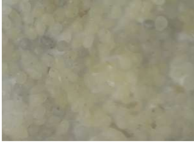
Figure 4. C. cephalonica eggs parasitized by Trichogramma sp. On the third day

Observations on developing the third instar larval stage of the parasitoid Trichogramma a sp. In the C. cephalonica host eggs, it can be seen that fundamental colour changes are starting to occur where it appears that the colour of the host eggs has turned greyish black (Figure 8). The time required for this colour change to occur is around 25 hours in the third instar larval stage.