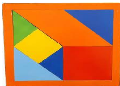
Figure 3. Tangram

The example of tangram in this research is