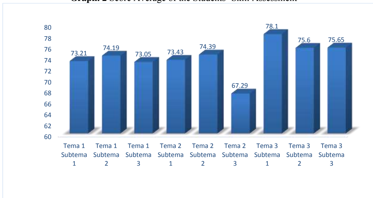
Graph. 2 Score Average of the Students' Skill Assessment

Based on Table 3 and Graph 2, it is found that from the authentic assessment instrument in the skill domain to develop the character values of citizenship on the theme 1 subtheme 1 to theme 3 subtheme 3 experienced a significant increase score, so that a score on the average total score obtained 90.15 and has a very high category.