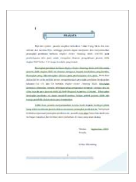
Figure 2. Foreword

The foreword is placed on the start page of the book as an opening communication between the author and the reader. The contents of the foreword is the author's attempt to communicate with the reader, by applying several types of principles, namely; 1) provide a statement that the appraisal tools are arranged appropriately and it is important to read and study, 2) The superiority of the content is presented in the appraisal apparatus, 3) The writer's expectations relating to the prospects for education and the perfection of the appraisal apparatus.