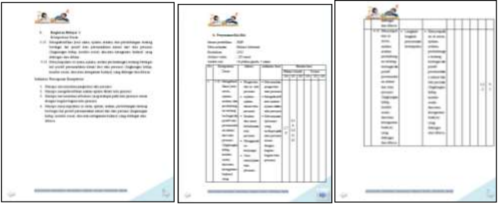
Figure 3. Learning Activities

Learning material contains material that has been determined in accordance with KI, KD, indicators, and learning objectives with the expectation that teachers and students can find out the results obtained.