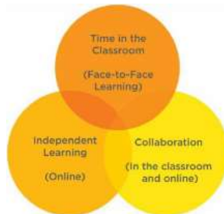
Figure 1. Blended Learning Concept